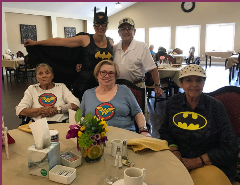
Villains, beware! Renaissance Village is full of caped crusaders!