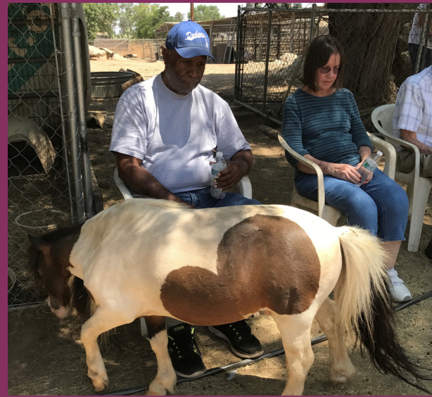
Looks like someone made a new friend at Mr. Joe's Farm.