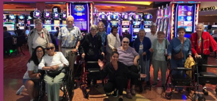
Everyone loves a good trip out to Morongo. We had a great turn out!