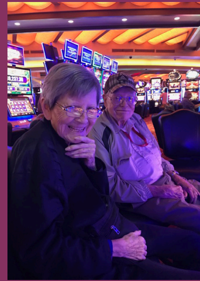
Contemplating her next big win!