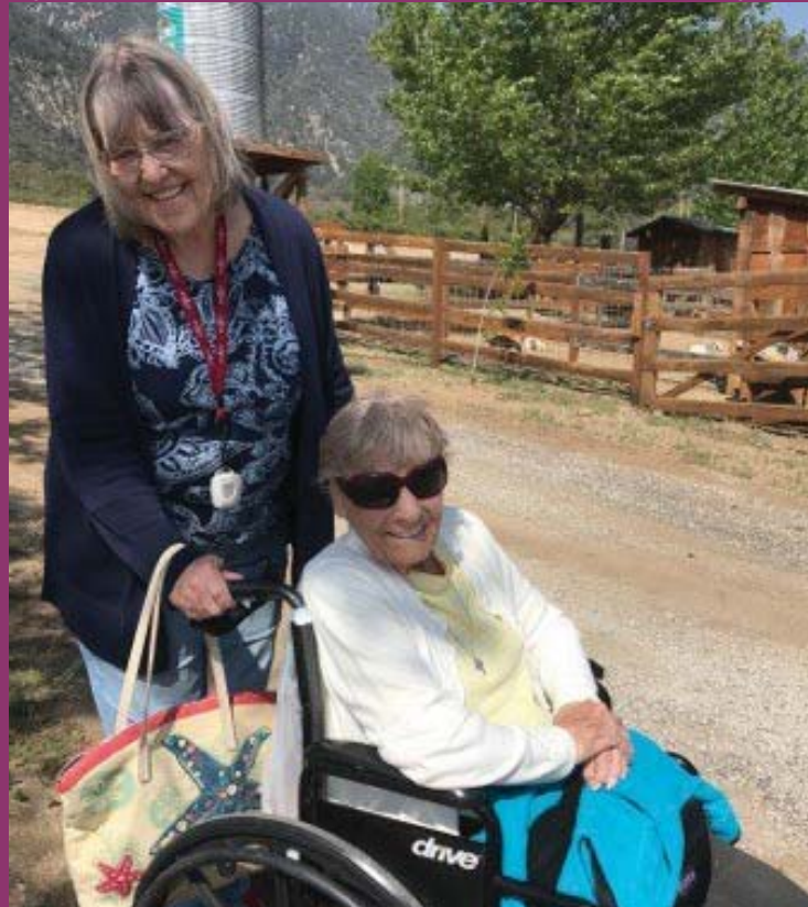
Walk & Rolls are always a real treat at Oak Glen.