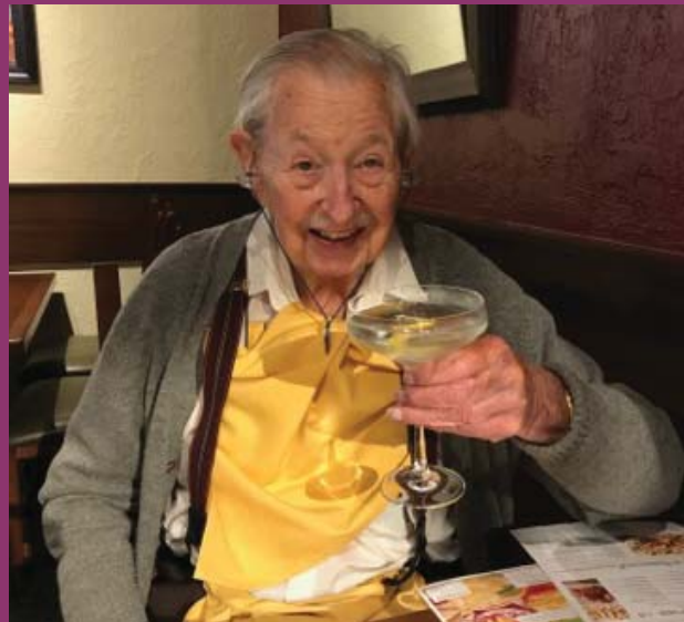
Cheers to another great outing to the Olive Garden.