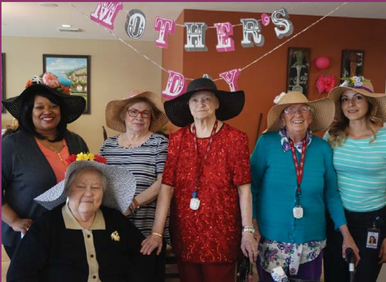
We decorated floppy hats at the Whimsical Mother's Day Tea Party.