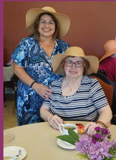
Sweet photo of mother & daughter.