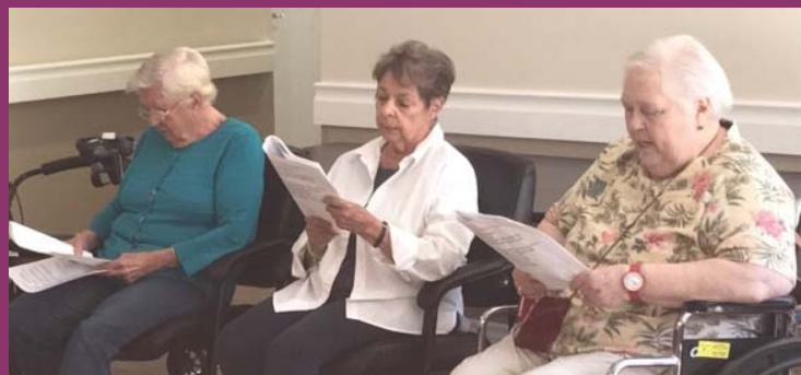
Gathering around to sing some Oldies but Goodies.