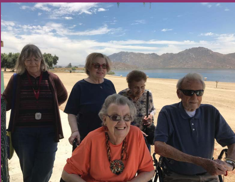
We're so ready for summer and more trips out to Perris Lake.