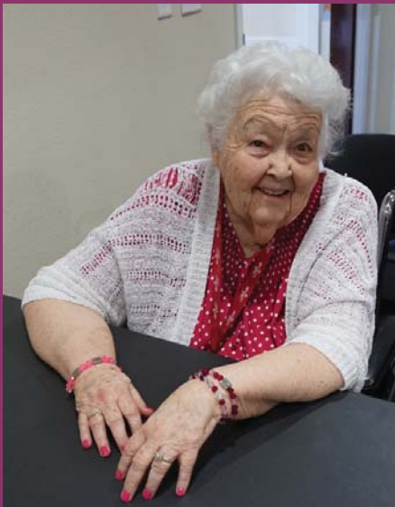
What a beautiful manicure!